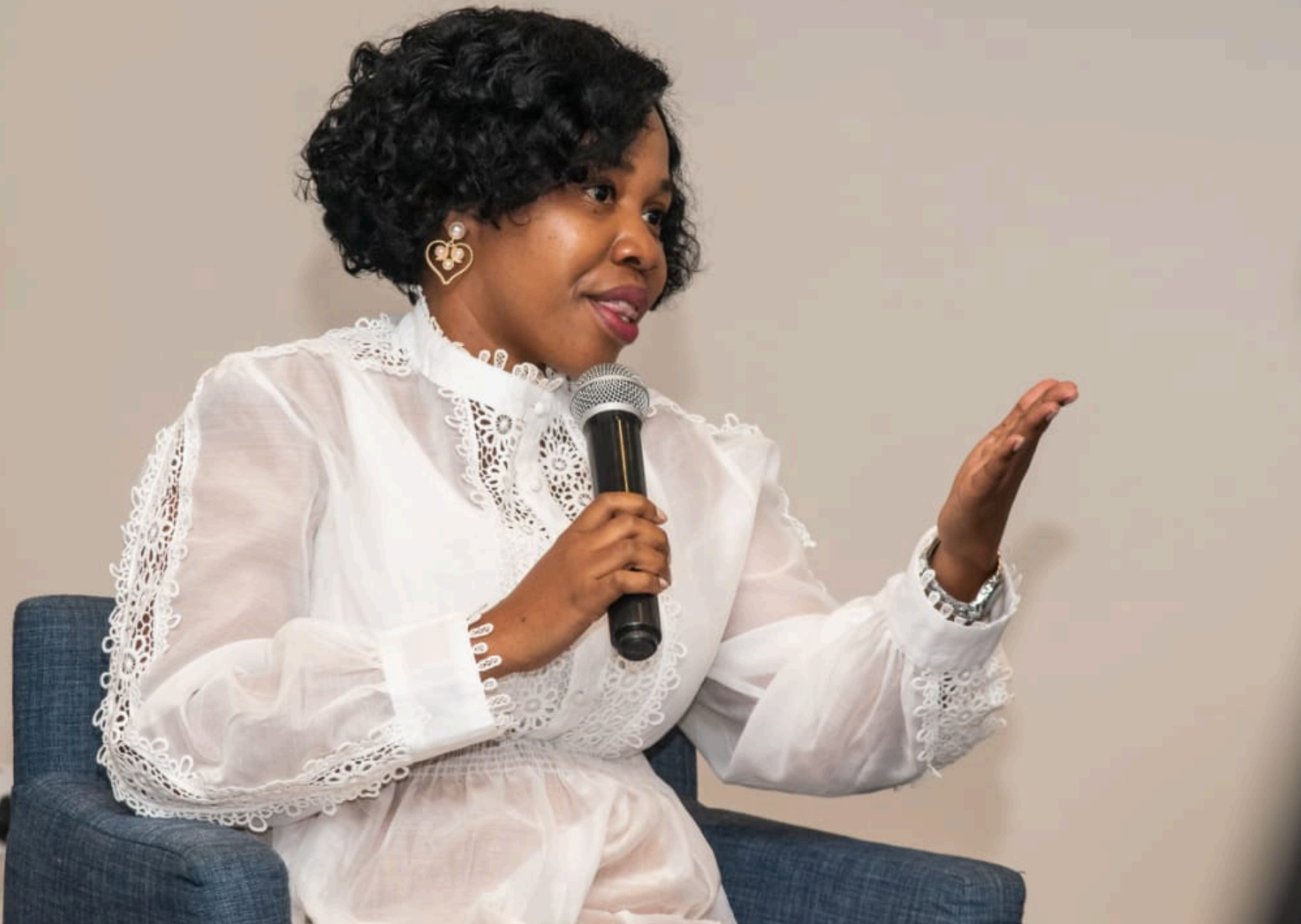
2023 AUGUST-PANELIST AT THE LAUNCH AFRICA GROWTH INITIATIVE AT BROOKINGS ,AGI FLAGSHIP REPORT FORESIGHT AFRICA IN PARTNESHIP WITH BIDPA