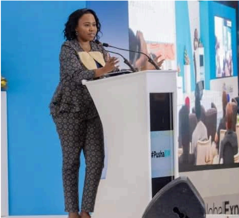
EXPERT MODERATOR PUSHA BW FORUM AT GLOBAL EXPO BOTSWANA 2023