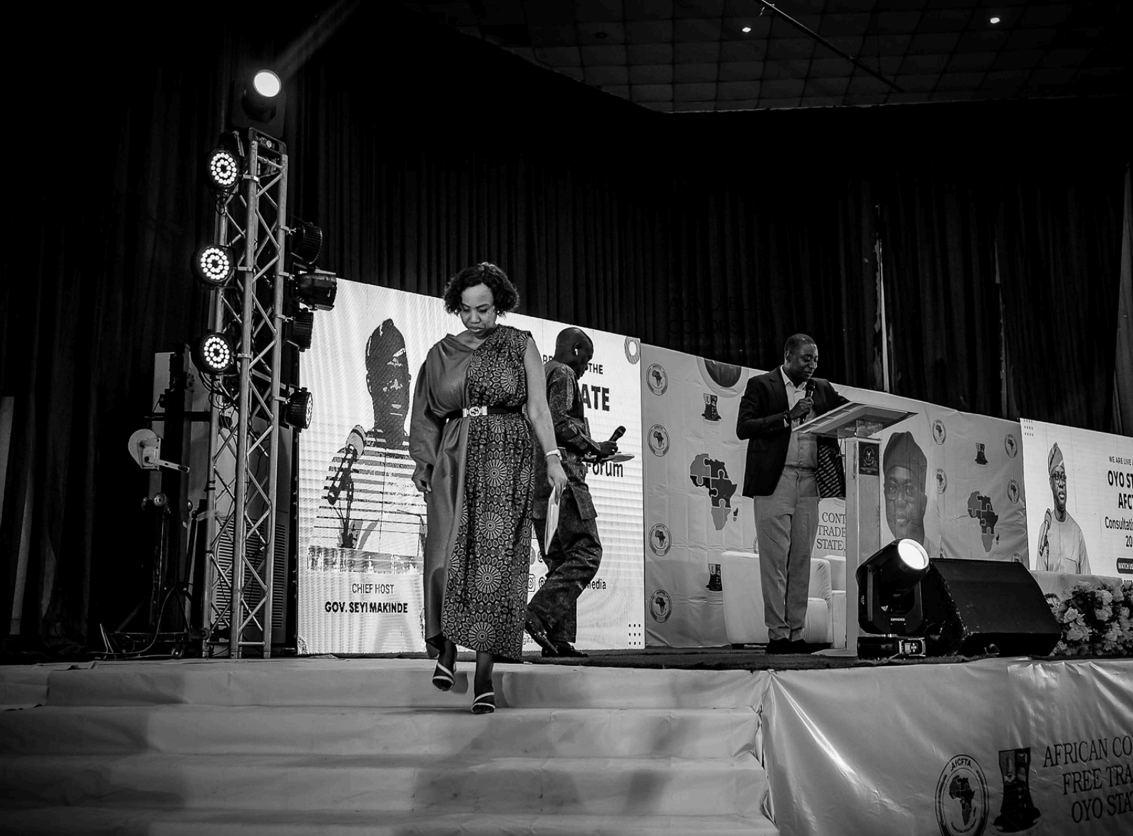
DESCENDING THE STAGE, LEFT THE NAME "NEO THEODORE TLHASELO" ETCHED IN THE HEARTS AND MINDS OF THE AUDIENCE.