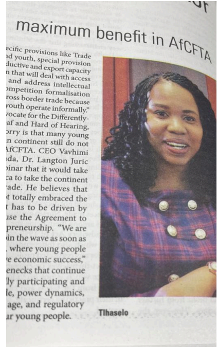
OVER 30 PRINT INTERVIEWS AS AN EXPERT IN HER FIELD