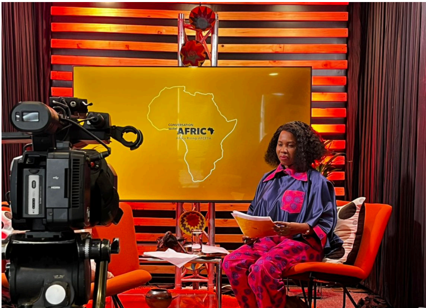
HOST AND BROADCAST FACILITATOR 2024 CONVERSATION WITH AFRICA TALK SHOW ON BTV NEWS DSTV CHANNEL 289