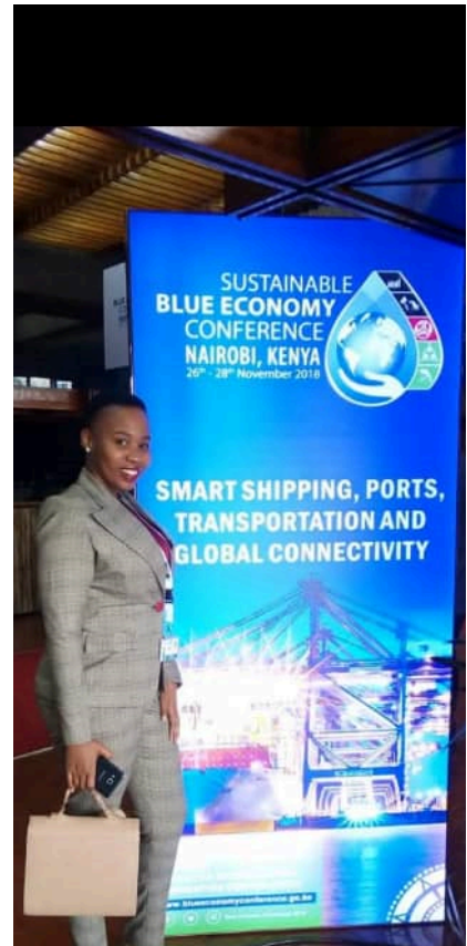
PANELIST -BLUE ECONOMY CONFERENCE KENYA 2018